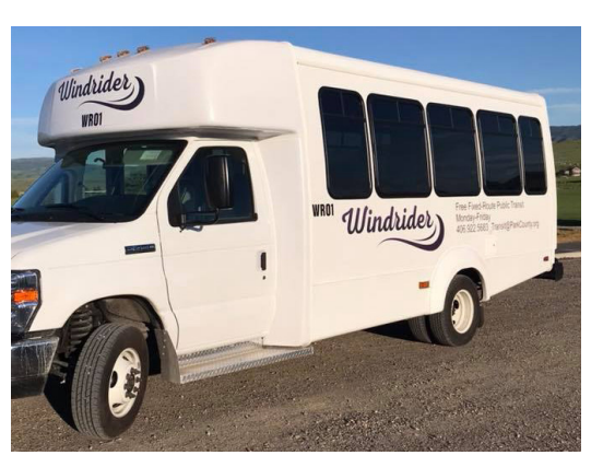
A Free Public Transportation Service in Park County, Montana

Fixed route services are available between 6:15 a.m. and 6:15 p.m.. Monday through Friday. The bus does not run on weekends or holidays.